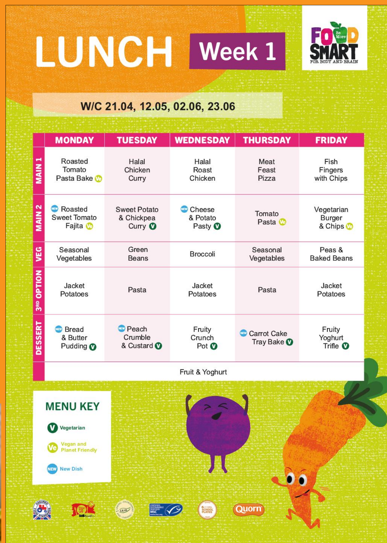
Example of the Spring Summer Menu